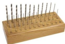
21. Drill bits