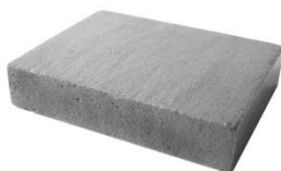
15. pumice plate