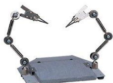
17. Third hand