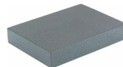
16. surface plate