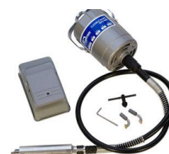
23. Drill machine